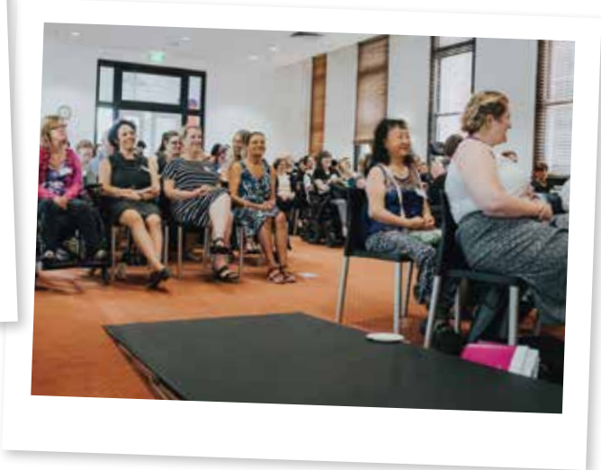
Images: Members enjoying – and performing in – our Free and Equal event in November 2017.