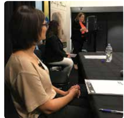
Left: Participants from local government and advocacy workshop: Preventing Violence against Women with Disabilities: Intersections of Gender and Disability. Right: Minister Natalie Hutchins speaks on the #MeToo movement.