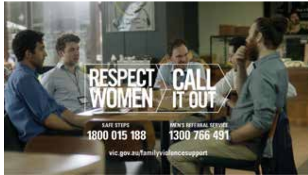
Video still from the 'Respect Women: Call it Out campaign'.