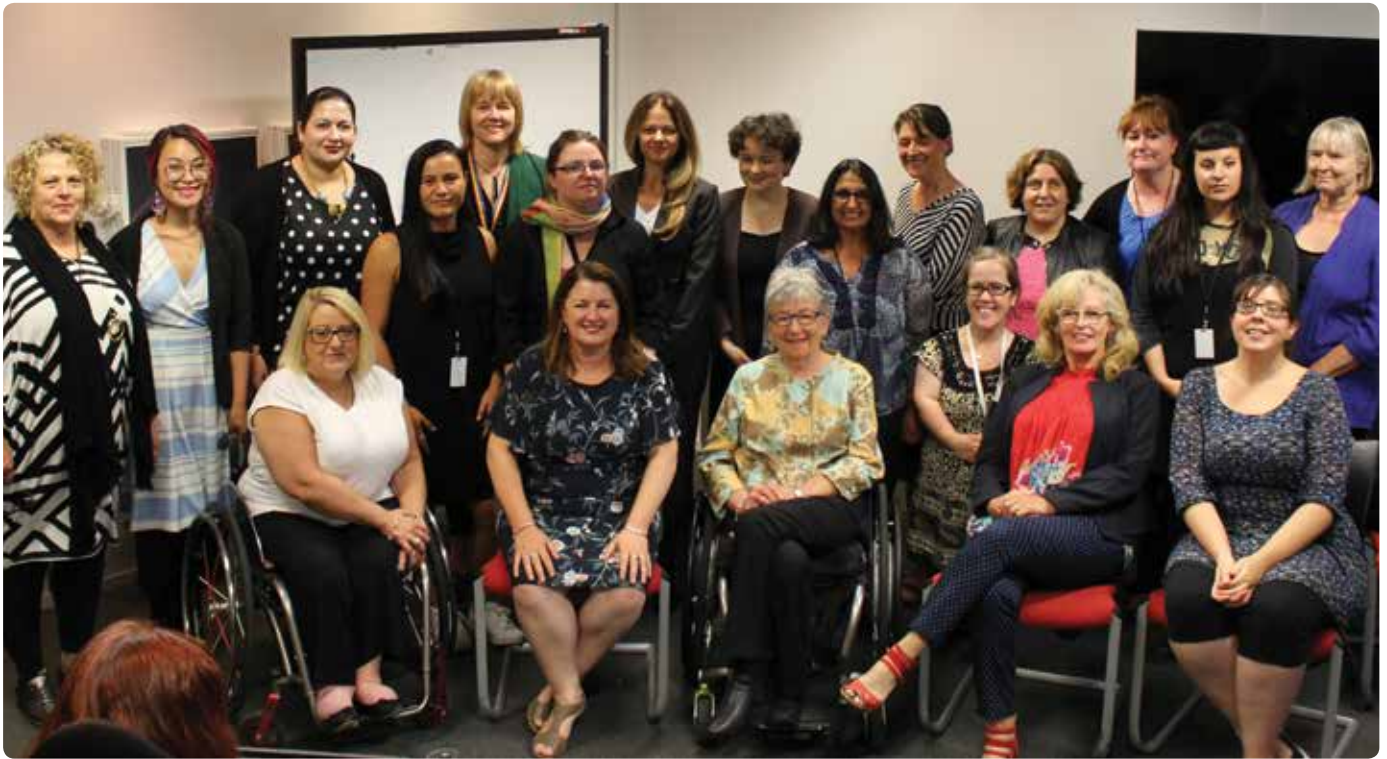
Minister Hutchins (with WDV staff and Board members) announcing continued commitment and funding for the Workforce Development Program on Gender and Disability.