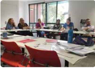
Training session in Ballarat.