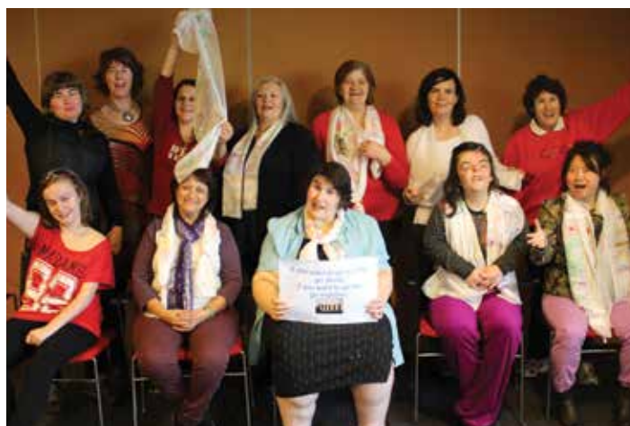
Graduates from the Dandenong course.