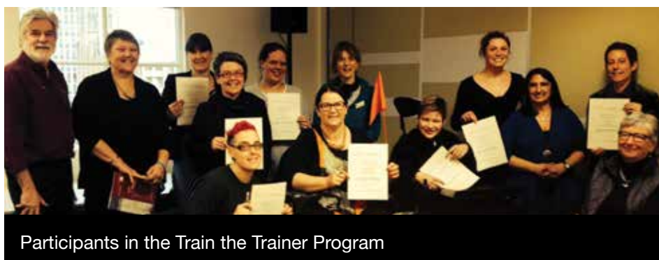
Participants in the Train the Trainer Program