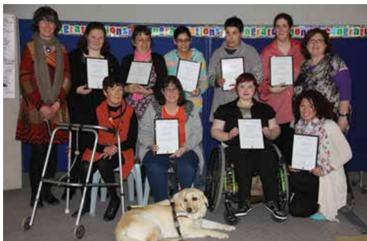
Graduates from the Gippsland Course.