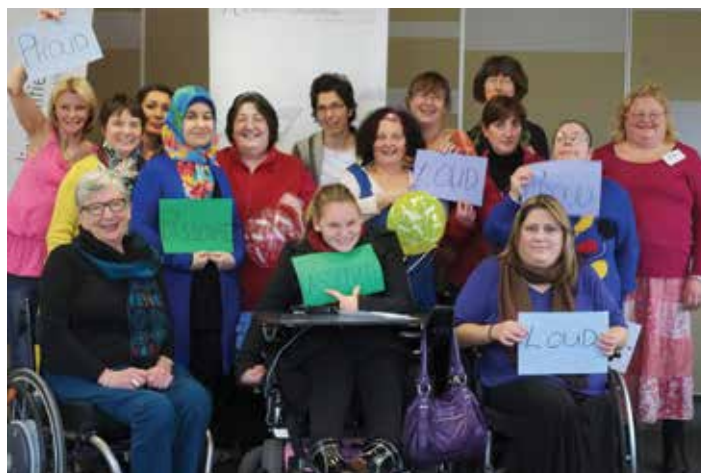
Graduates from the CBD course.