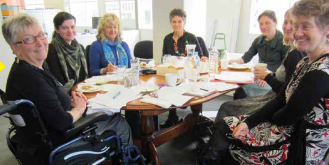
Voices against Violence project management group, August 2012