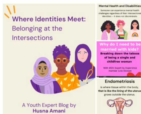
Youth Experts by Experience Blogs