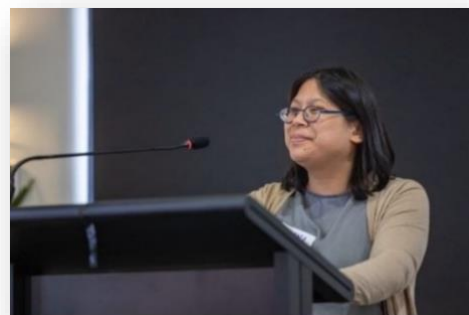
2024-25 Summer Enabling Women Leadership Program: Graduation Celebration

This program builds leadership capability and establishes partnerships across Victoria, CIWE enables are program participants and CIWE staff members to advocate for change in their communities making sure to platform the voices of women and gender diverse people with disabilities in local activities and creating positive change.